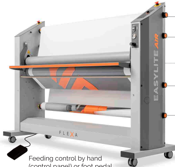
Feeding control by hand (control panel) or foot pedal (hand free operation)