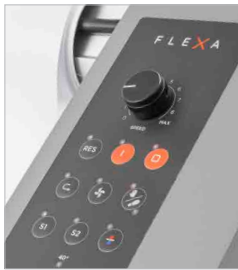
Control panel for adjusting temperature, speed and many more parameters