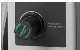
Pressure regulator of the upper roller