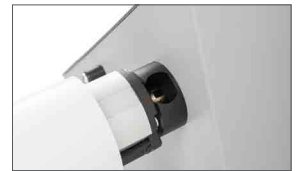
Aluminum shafts with automatic locking system and millimeter scale