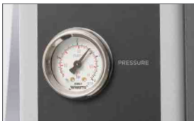
Gauge to display the pressure of the upper roller