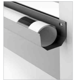
Front tray for prints (optional)