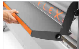
Swing-up steel feed table for quick set-up