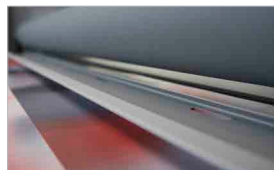
Feed-in guide (optional)