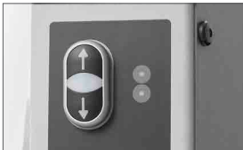
Pneumatic lifting and lowering of the upper roller by electric buttons