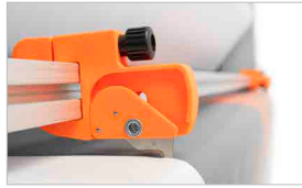
Cutting unit with titanium coated blades, safe for the operator, to trim the laminated media (optional)